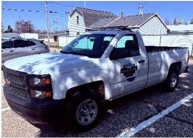
Code Enforcement Unit – Shared resource with City of Clio